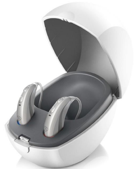
The rechargeable EXCITE hearing system AQ jam XC R as a BTE model in an elegant charging station

Hamburg, Monday, September 23, 2019: At the end of this year, HANSATON is set to expand its EXCITE product portfolio with a rechargeable behind-the-ear (BTE) hearing system which will be presented in an elegant and practical charging station. In addition to the already available receiver-in-canal (RIC) hearing system AQ sound XC R with a rechargeable lithium-ion battery, HANSATON will also offer BTE hearing system wearers the complete service and function package of the innovative EXCITE chip with its AQ jam XC R system.